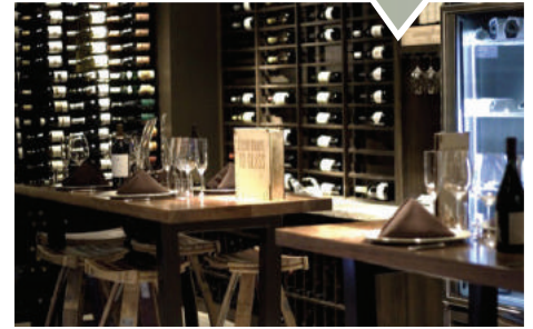
Marina Kitchen Wine Cellar

Marriott Marquis San Diego Marina 333 West Harbor Drive San Diego, California 92101 USA