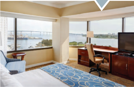
Guest Room Panoramic View